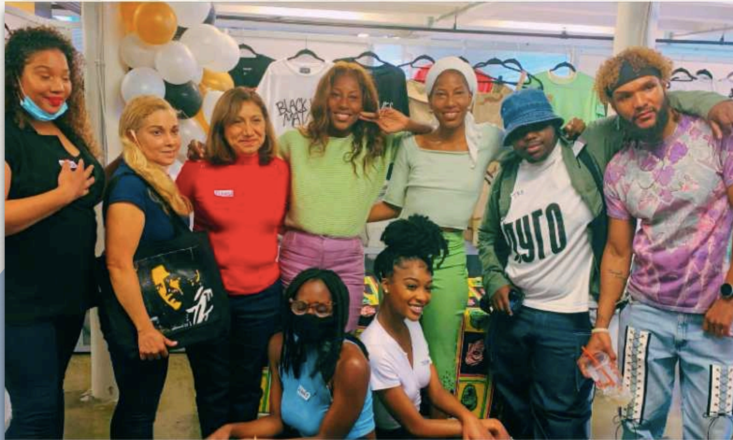
On August 3, 2021, the first Garment Industry Pre-Apprenticeship Program cohort at SoHarlem graduates. Graduates were also able to showcase their talent and new skills.

As a collaborative effort, SoHarlem, HBK, and UMEZ, designed and built program tools, a staffing infrastructure, and workforce operating procedures to support SoHarlem's growth as a demand-driven workforce development provider in the creative sector in Upper Manhattan.